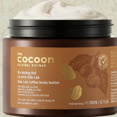
Dak Lak Coffee Body Butter