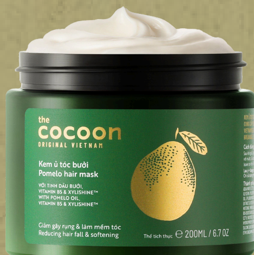
Pomelo Hair Mask