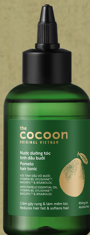
Pomelo Hair Tonic