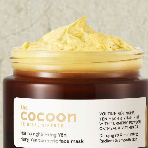
Hung Yen Turmeric Face Mask