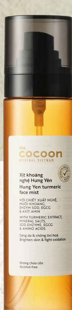
Hung Yen Turmeric Face Mist