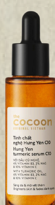
Hung Yen Turmeric Serum C10