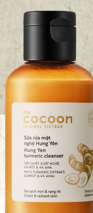
Hung Yen Turmeric Cleanser