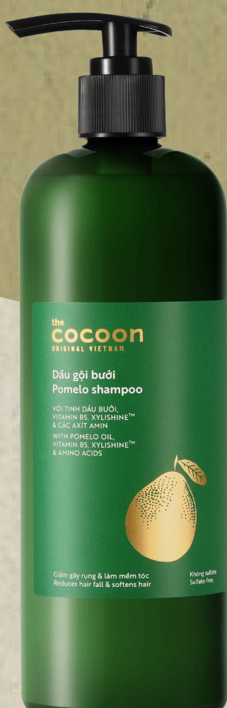
Pomelo Hair Shampoo