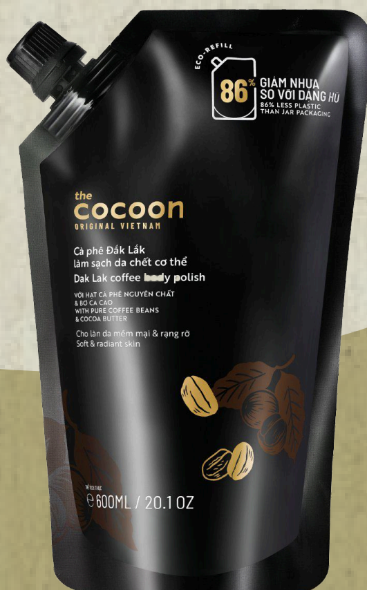
Dak Lak Coffee Body Polish (Refill)