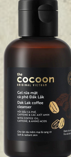
Dak Lak Coffee Cleanser