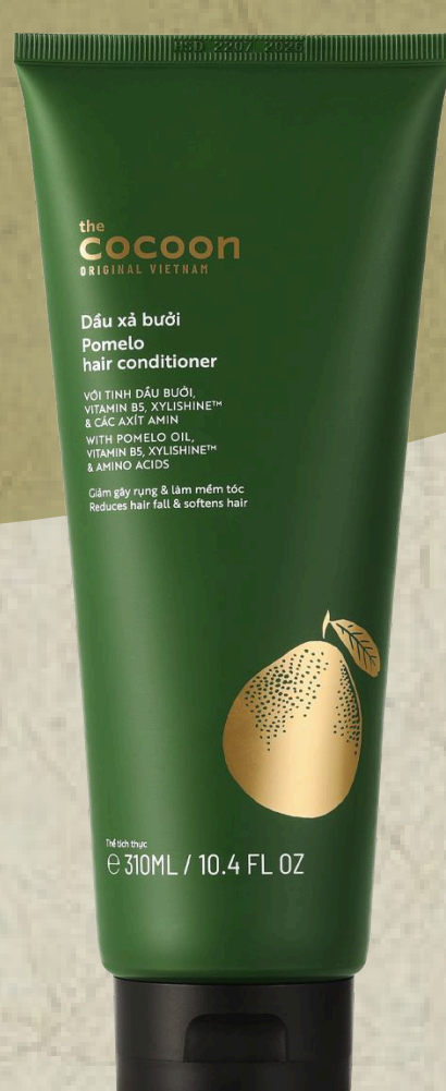
Pomelo Hair Conditioner