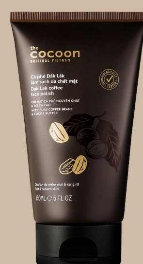
Pomelo Hair Conditioner From $23.56