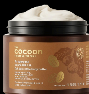
Daklak Coffee Body Butter From $26.35