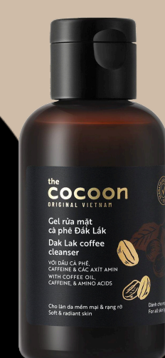
Daklak Coffee Body Polish From $26.35