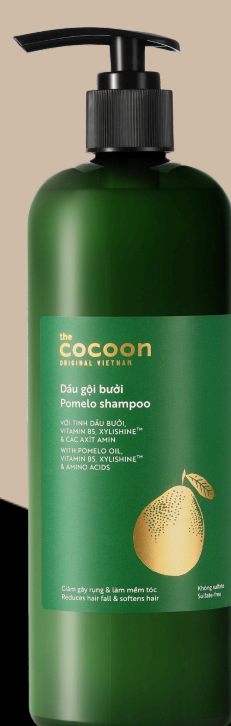
Pomelo Hair Shampoo From $23.56